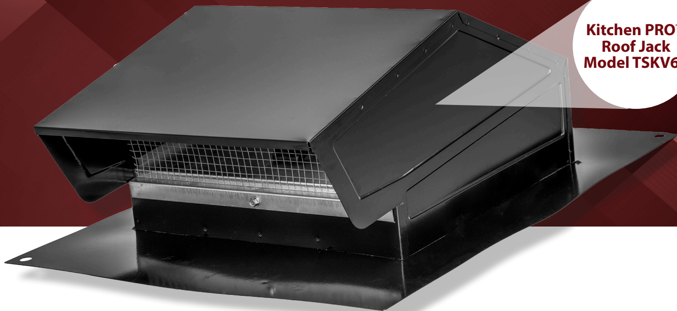
Kitchen PRO™ Roof Jack Model TSKV68